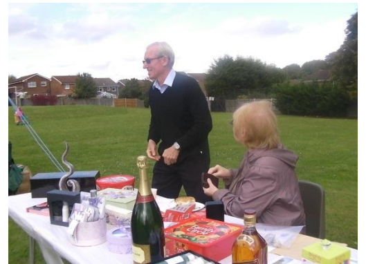
The raffle >>> prizes...where are those tickets?