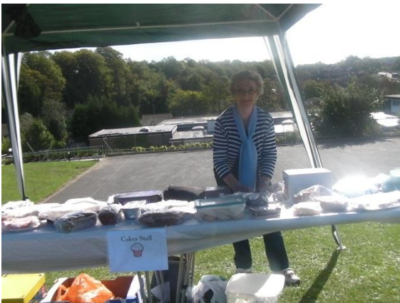
<<<< The table was overladen!!!