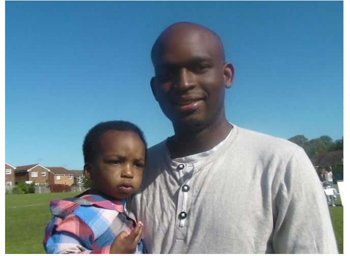
Parishioners arrive...along with their child, beautiful kiddies who so often smiled...