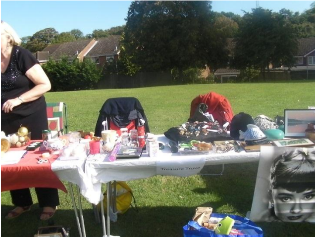
Brica-a-bac..white elephant.. some special goodies here!