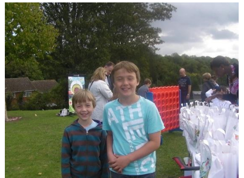
A wonderful day to fill the till! >>>>>>>>>>