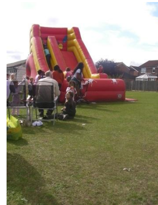
...and a bouncy castle up the hill!