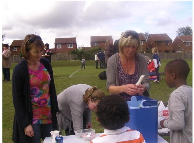
<<<<<<Ice-creams always go down well There's plenty more so your friends go tell.