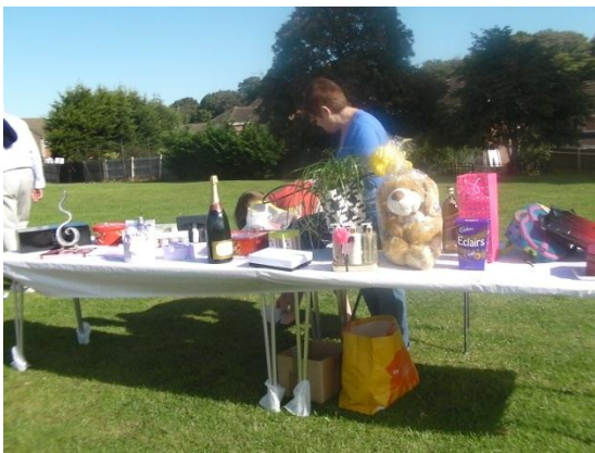
<< So many prizes donated!