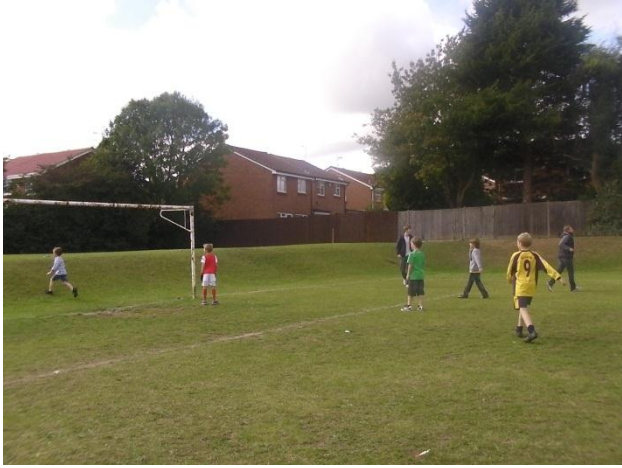
<<<Football crazy these little lads, Out-manoeuvring their aging dads!