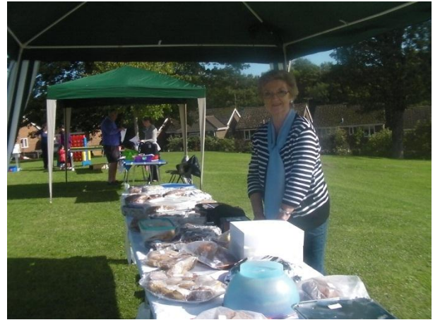
And there's more! Delectable delicious delightful scrumdiddli-umptious carrot cake...oo the calories ooh.. the cakes just kept arriving!