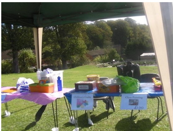
Little girls and big ones love bracelets>>>>