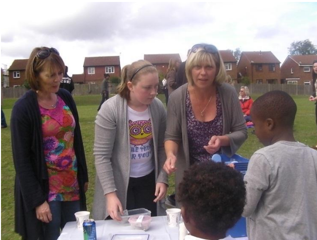
It truly was a brilliant day and even the rain it stayed away!