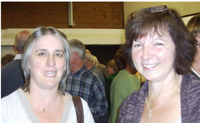
A sumptuous buffet was provided Scrumdiddliumptious!